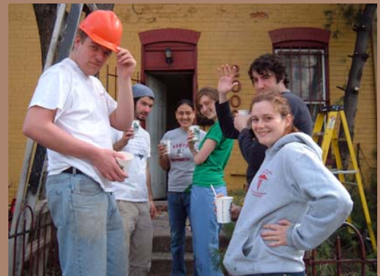
BU Hillel students on-site at a community service project