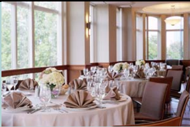
A corporate event (above) and wedding (below) in the third floor dining room