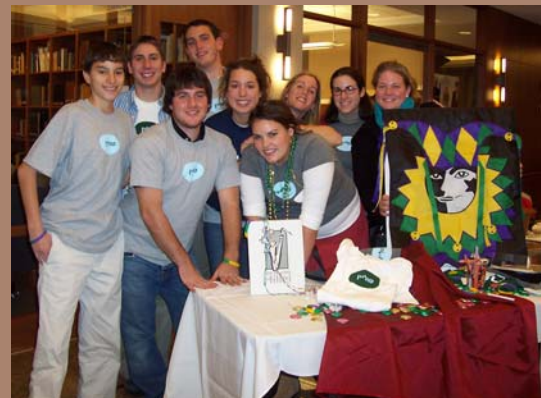
Tulane students enjoy Shabbat dinner at BU Hillel