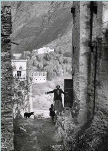
'Balancing', Yemen, 1992